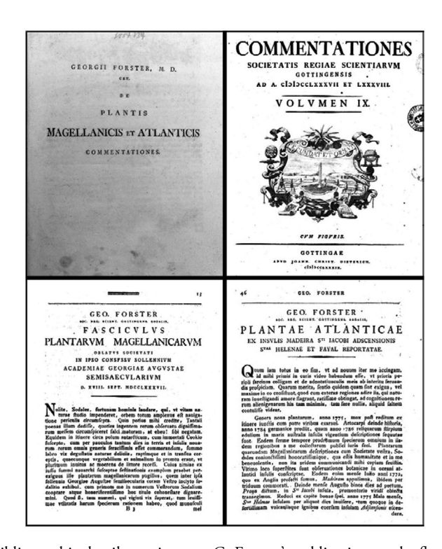
Figure 1. Bibliographic details pertinent to G. Forster's publication on the flora of Atlantic Islands where he described new Macaronesian species for Cabo Verde and Madeira. Top left: Cover of preprint published between March and April 1788 (courtesy of Georg-August-Universität Göttingen , SUB Goettingen, call number: 8 BOTV, 9220). Top right: Cover of volume 9 of Commentationes Societatis Regiae Scientiarum Gottingensis , year 1789. Bottom left: First page of article on Tierra del Fuego plants as it was published in volume 9 of Commentationes Societatis Regiae Scientiarum Gottingensis . Bottom right: First page of article on Atlantic Island plants as it was published in volume 9 of Commentationes Societatis Regiae Scientiarum Gottingensis . Images from volume 9 of Commentationes Societatis Regiae Scientiarum Gottingensis are public domain (<a href="https://archive.org/details/bub_gb_BigC_3BYCdMC/page/n4">https://archive.org/details/bub_gb_BigC_3BYCdMC/page/n4</a>; document provided by the Biblioteca Nazionale Vittorio Emanuele III , Naples).

letters from George refer to offprints then being printed, and a 13 May 1788 letter from George that refers to some copies of the offprints accidentally having been left behind in Frankfurt by his servant. It can be presumed that these preprints were distributed by March or April 1788.