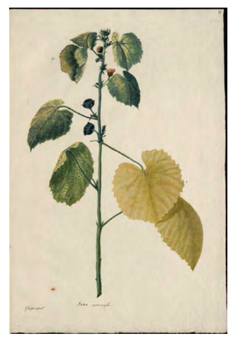
Figure 3. Watercolor of Sida pannosa G. Forst. (Malvaceae) made by Georg Forster, based on material apparently recorded in Cabo Verde Islands during the second voyage of Cook.

that remained unpublished as an incomplete manuscript housed at BM (Britten 1904; Francisco-Ortega et al. 2015).