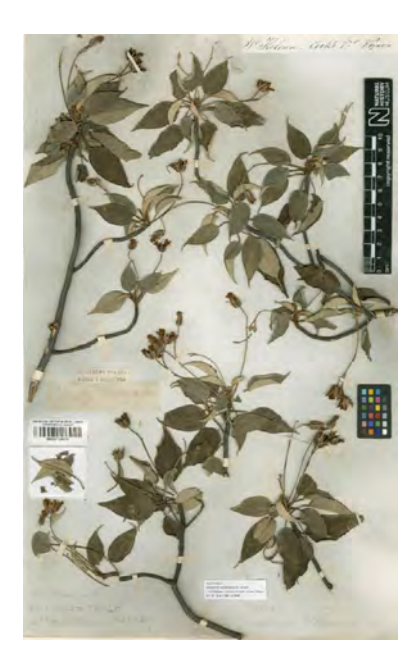
Figure 3. The type specimen of Trochetiopsis melanoxylon collected by Joseph Banks and Daniel Solander on St Helena in 1771. The species is endemic to St Helena. It is globally extinct and the Banks and Solander type collection made in 1771 was the last collection of the species. There are two other species of Trochetiopsis endemic to St Helena: T. erythroxylon is Extinct in the Wild and T. ebenus is Critically Endangered. Image from the Natural History Museum, London data portal (data.nhm.ac.uk), , used under a CC-BY 4.0 licence. © The Trustees of the Natural History Museum, London.

The Trustees of the Natural Tristory Museum, London.